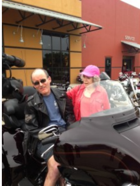
My Mother standing by my side as I am interviewed by a TV news reporter.

Mom, I am one of the most fortunate persons alive, because you are my courageous and heroic Mother. I am overwhelmed with gratitude, that God has allowed me to experience such extraordinary Love and commitment in my lifetime—that you are my Mother!