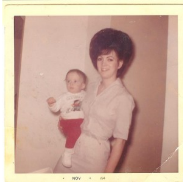
My Mother holding me during my first year of life.